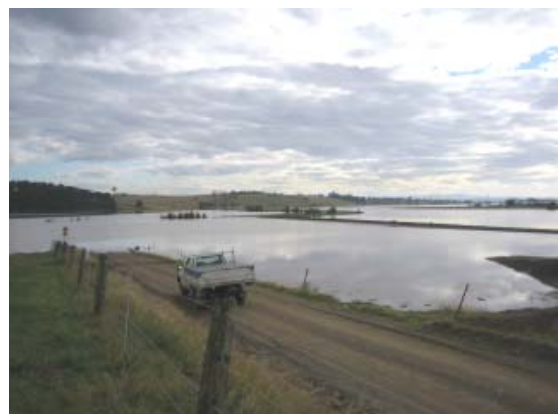
Flooding in the Hunter region, June 2007