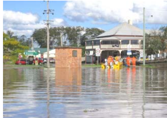
Emergency services responding to flooding