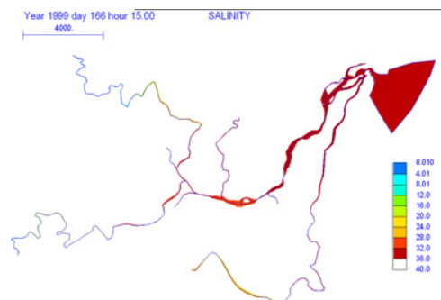
Overview of the Nambucca River estuary network coloured by salinity