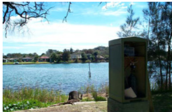
MHL's water level recorder at Narrabeen Lagoon