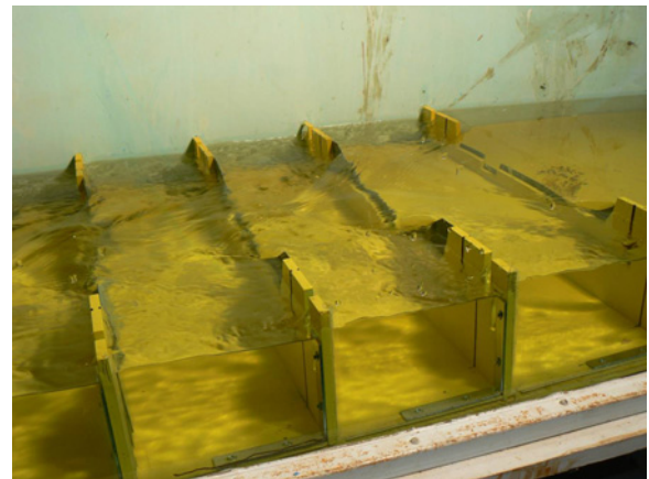
Hydraulic behaviour over the trapezoidal weirs

Modifications to the weir were designed focusing on the weir side slope and slot dimensions to improve the hydraulic behaviour for fish passage. For the CFD analysis, the results complimented the understanding of the recirculation zones and turbulence characteristics through the weirs.